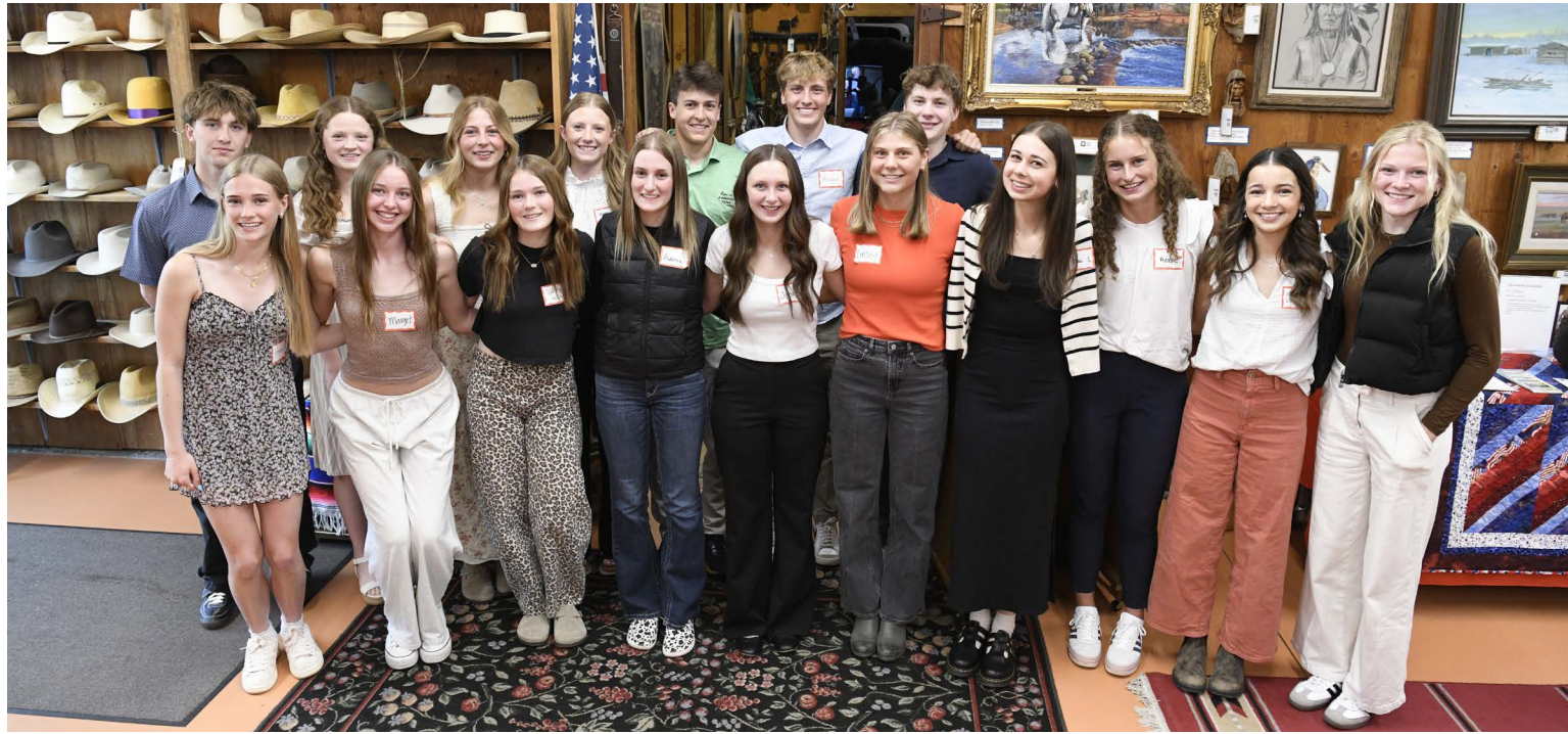
High school healthcare scholarship recipients